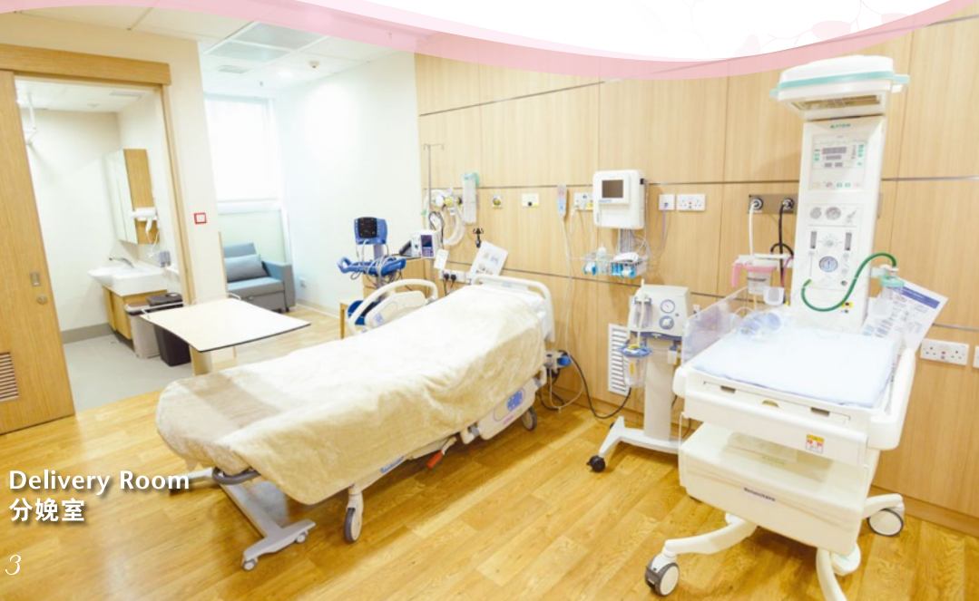
Delivery Room 分娩室

本院產科部的房間乃經特別設計，其鑲入式燈光設計可調節照射角度和亮度，睡床乃經特別設計的產床。準媽媽毋須於臨盆時轉移至產房，可直接在入住的分娩室自然分娩，在至親與專業人員的陪伴下迎接新生命，倍添安心和舒適。