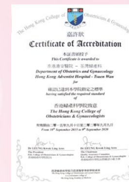
Hong Kong College of Obstetricians and Gynaecologists 香港婦產科學院